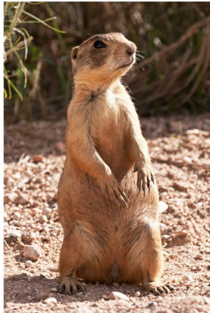
Utah prairie dog ( Cynomys parvidens ) | G2 - Imperiled