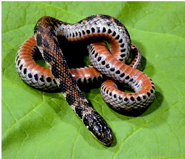
Kirtland's snake ( Clonophis kirtlandii ) | G2 - Imperiled